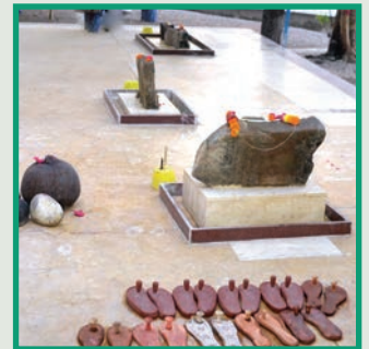
TEMPLES IN THE COMPANY'S TOWNSHIP AT REWA, MADHYA PRADESH