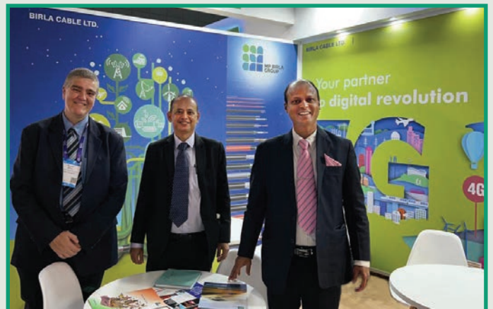
Birla Cable participated in Mobile World Congress 2023 held in Barcelona, Spain.