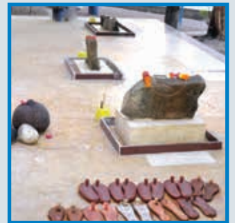
TEMPLES IN THE COMPANY'S TOWNSHIP AT REWA, MADHYA PRADESH