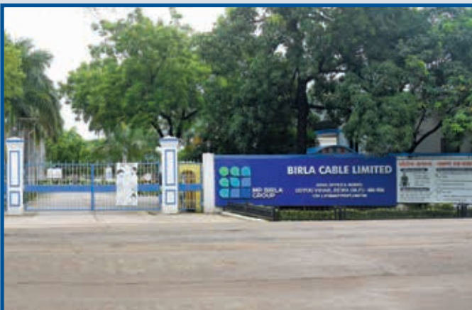
Birla Cable Ltd. - Plant Entrance