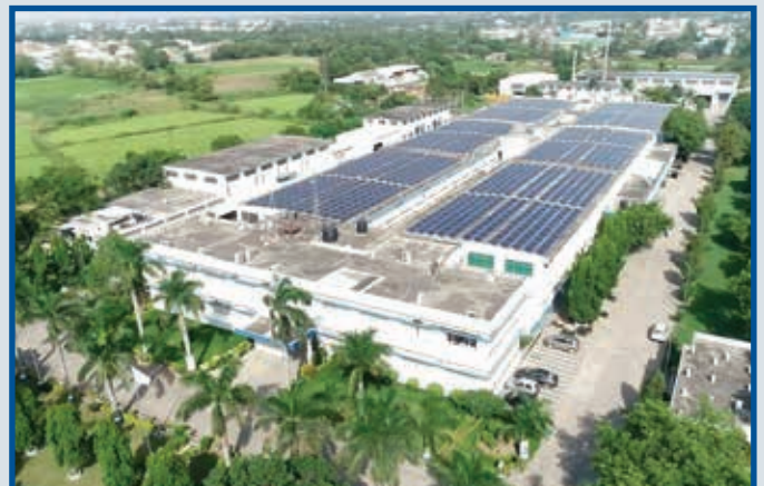
Birla Cable Ltd. - Plant Aerial View